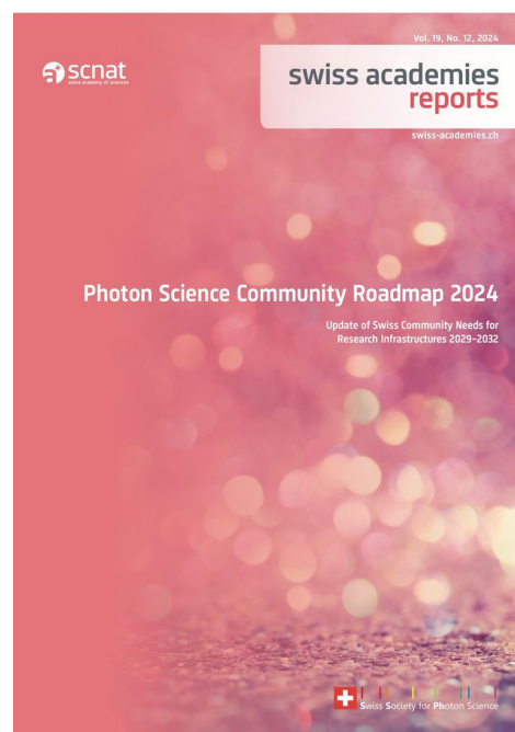
The 2024 Photon Science Community Roadmap

The 2024 update of all seven community roadmaps was coordinated by SCNAT under a mandate by SERI and executed by its member societies and commissions in the respective fields. For photon science, we have collected the scientific vision and needs of users of the national institution-based laser platforms, the synchrotron Swiss Light Source (SLS) and the X-ray free-electron laser SwissFEL, as well as of international photon science facilities with current Swiss participation (the European Synchrotron Radiation Facility, ESRF, and the European X-ray Free-Electron Laser, EuXFEL).