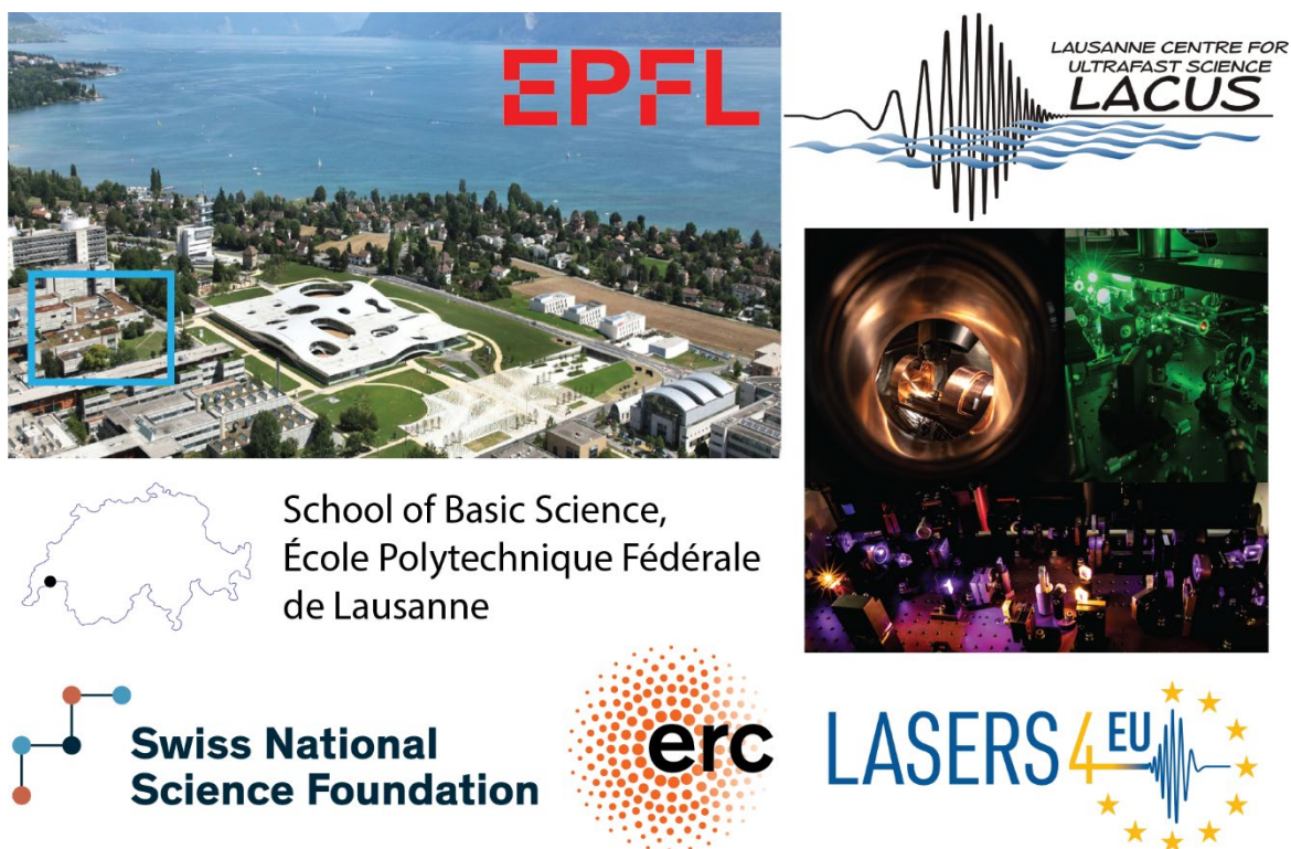
Figure 1 The location of the LACUS centre, a virtual tour of the laboratory is available at the following link: https://schools-virtualtour.epfl.ch/01_epfl_ecublens/14_epfl_lacus/index.html .

Since 2020, the centre has been led by Prof. Fabrizio Carbone, who has broadened its focus to incorporate advanced ultrafast electron scattering methods. The centre now features three advanced instruments, which are described in this brief overview. These instruments were created with initial funding from the Swiss National Science Foundation and the European Research Council.